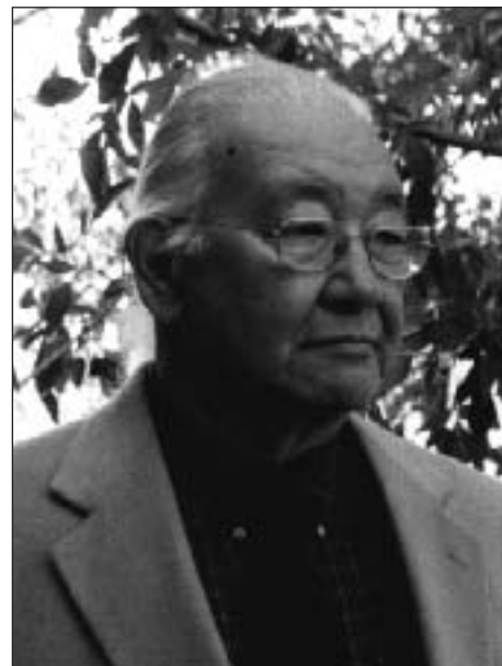
Keynote speaker N. Scott Momaday, Repatriation Foundation Advisory Committee Member