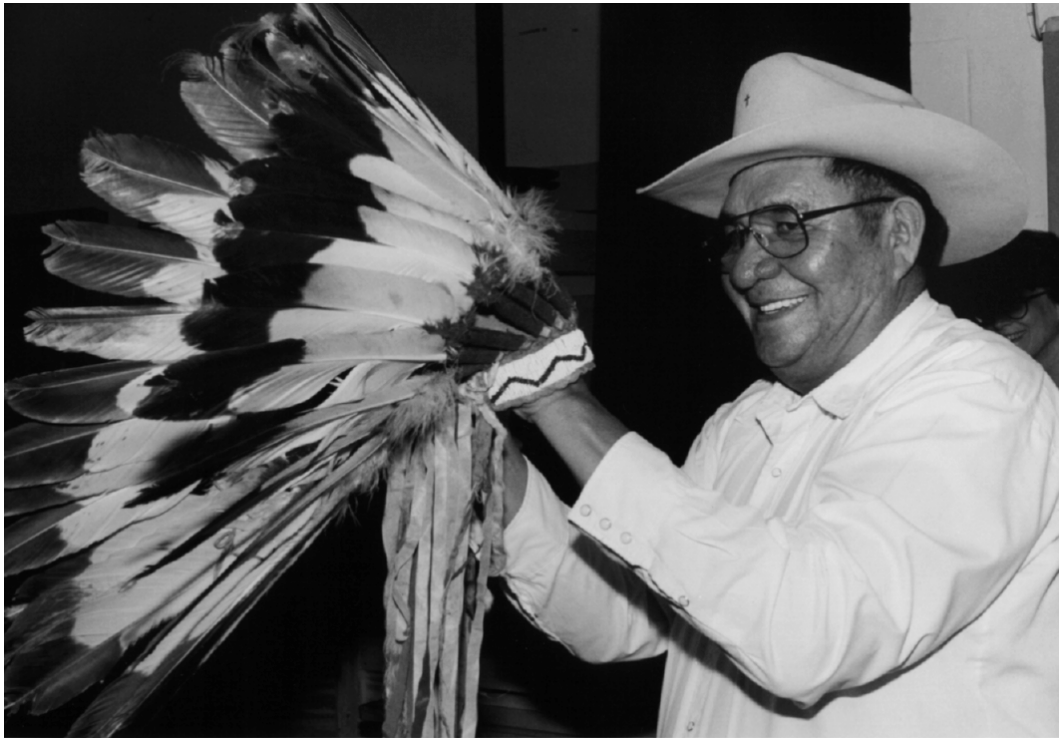
Visiting Blackfeet delegation.